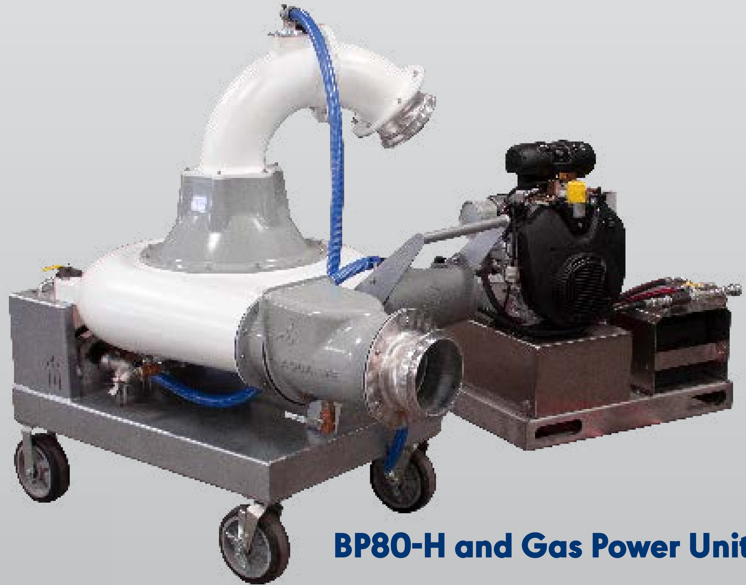
BP80-H and Gas Power Unit