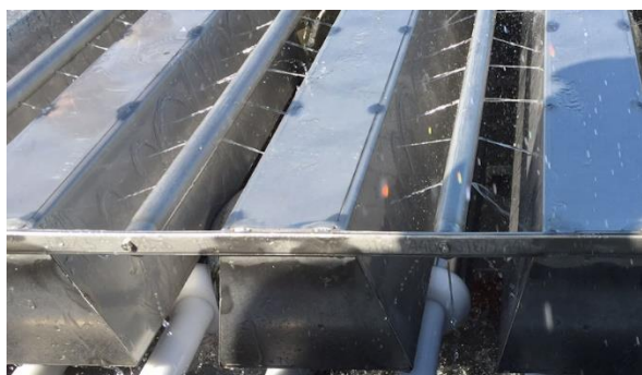
Flushing water and a well proven design ensures a gentle grading process