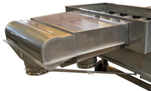
Dewaterer designed to grader model, fish size and water flow